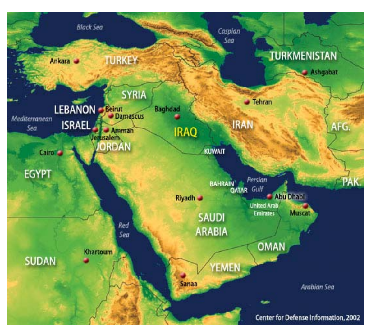
Figure 1. Middle East Regional Map (From Ref. \frac{\text{http://www.cdi.org/terrorism/iraq map.cfm}}{\text{(Accessed on 13 June 2004)}}

While the past sheds light on Iran's strategy for post-Saddam Iraq, this question can only be partially answered until Iran's security policy leaders and institutions are also examined. Chapter III will explore these leaders and institutions with the goal of gaining an appreciation for their alternately competing and complementary security policy agendas.